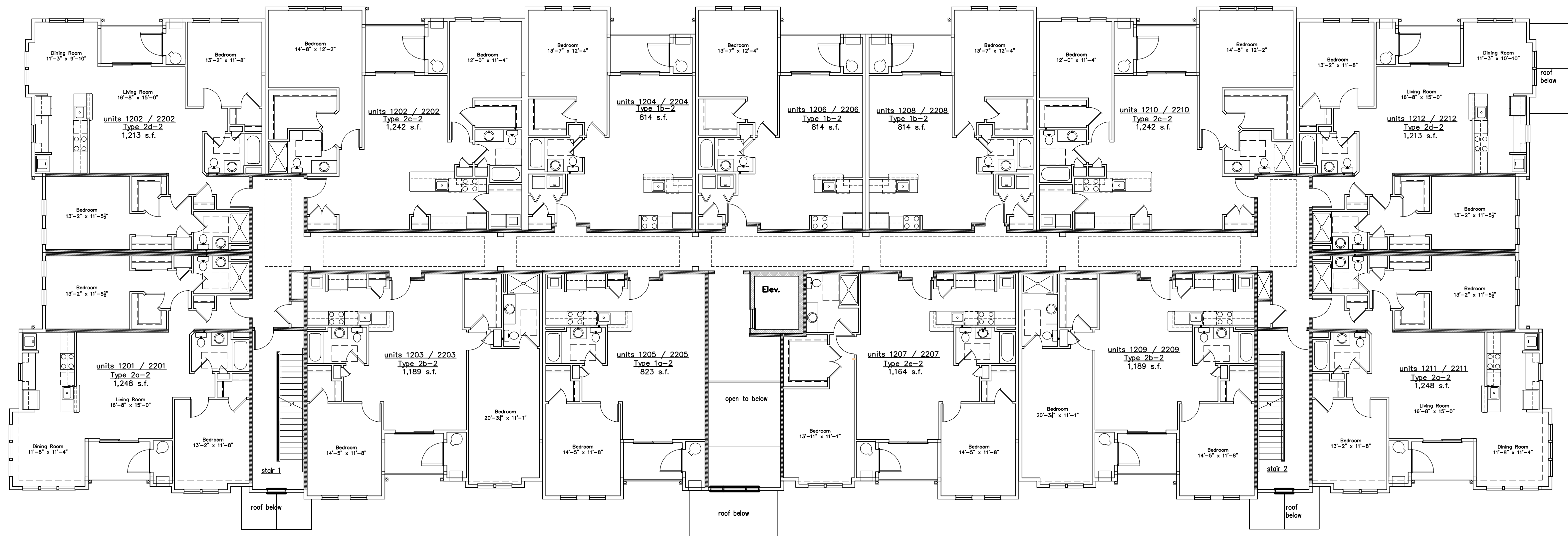
building 1 & 2 typical second Floor Plan