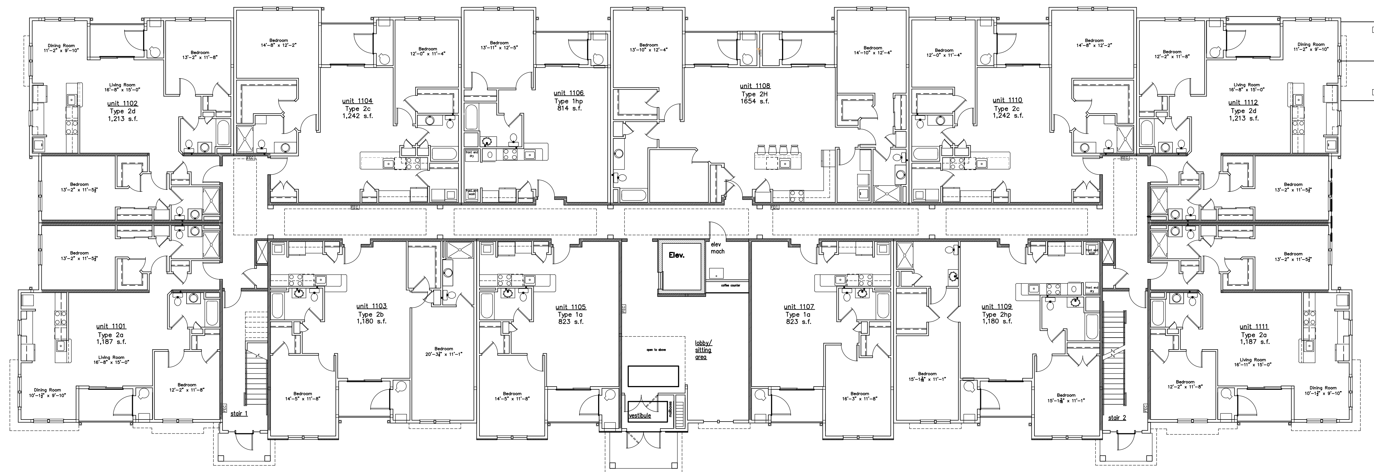
building 1 First Floor Plan